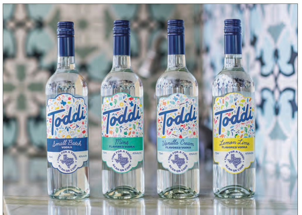
BOTTLED IN GRANBURY: Toddi Vodka is produced using 100% non-GMO, American-grown corn, all natural ingredients and are naturally gluten free. Toddi Vodka is available in four flavors (from left to right) Toddi Small Batch Vodka (sugar free), Toddi Mint Vodka, Toddi Vanilla Cream Vodka and Toddi Lemon Lime Vodka.

"We created eye-catching labels that speak to our deep Texas roots, but we also fill our bottles with premium vodka. We're proud of providing such exceptionally